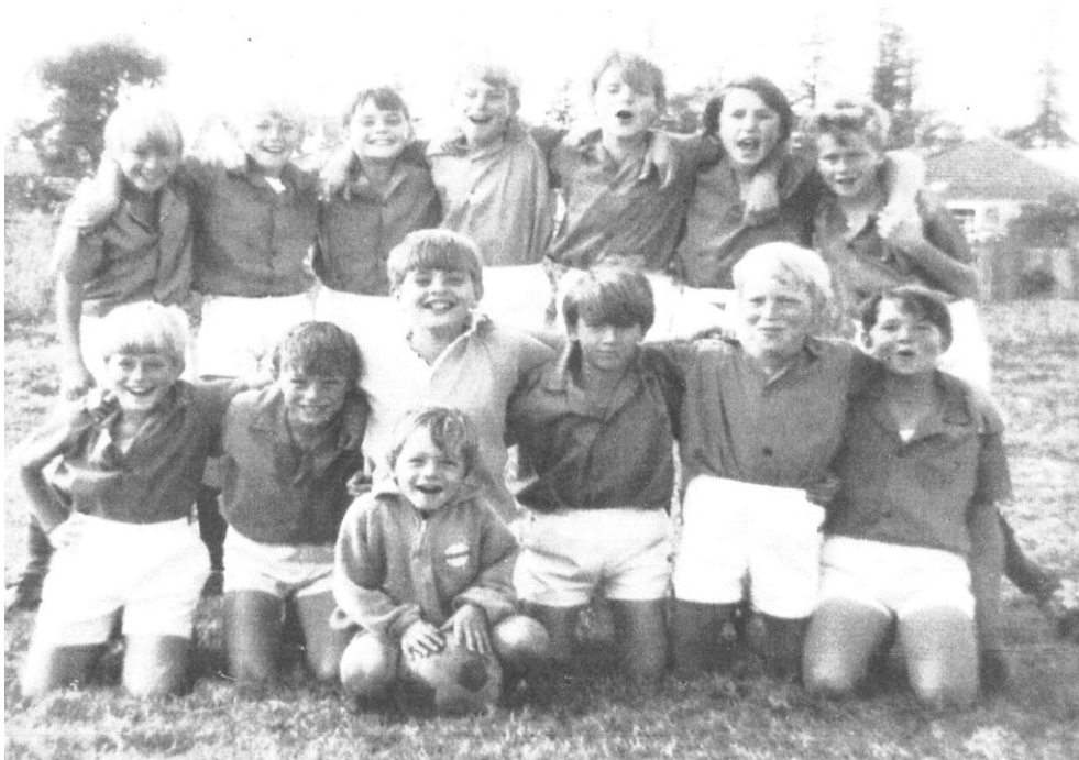
HIGH ON LIFE!